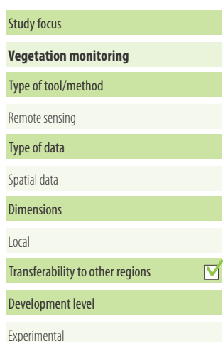
Marlena Kycko is a researcher at the Department of Geoinformatics, Cartography and Remote Sensing at the University of Warsaw. Her research focusses on use of remote sensing for vegetation monitoring.

The research unveiled varying species resistance to human trampling and water stress, with noteworthy alterations in CCI values, Normalized Difference Vegetation Index (NDVI), and Water Band Index (WBI). A whopping 87% of polygons demonstrated these distinctions. The study pinpointed trampling-resistant species through remote-sensing