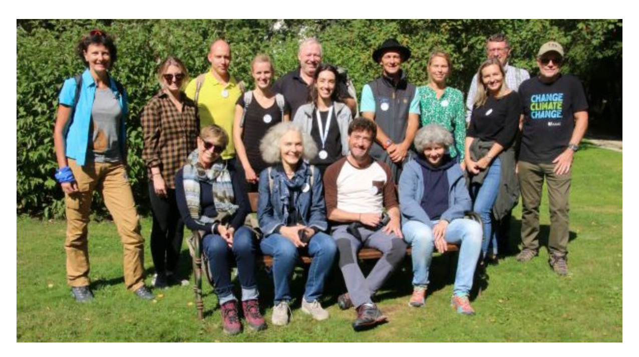
Figure 2: Inspired by nature. Under the guidance of knowledgeable ranger, we took the opportunity for a walk in the surrounding nature. We were looking for "cooperations" in nature and found them in symbioses (lichens), reciprocities (plant and pollinator) or interaction in herds, swarms or flocks.