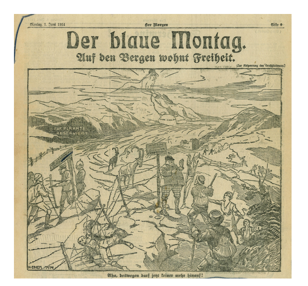
Figure 5 – Early debate about a public right of way. Cartoon by H. Einer (1914).

The story of Hohe Tauern NP starts in the early years of the 20<sup>th</sup> century and, after countless intermediate steps, reached a temporary end in 2006 with the international recognition by the IUCN of the Salzburg part of the NP. While the early years were marked by scepticism of environmentalists towards touristic over-usage of the park, the debate around hydropower utilization soon became a priority issue.