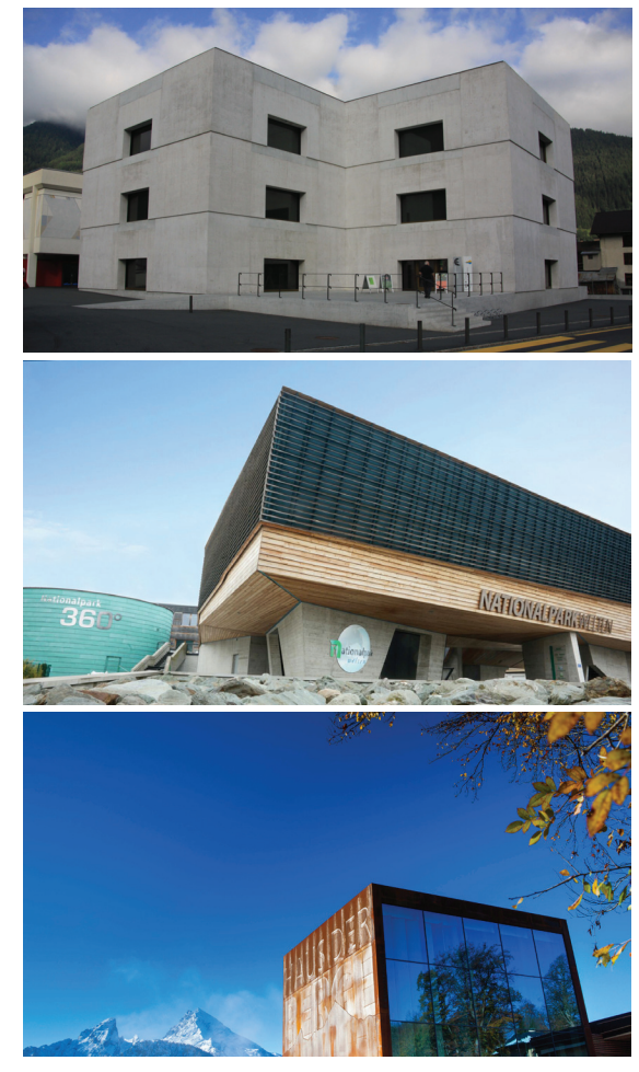
Figure 7 – Visitors centres as landmarks. Swiss NP (Zernez), Berchtesgaden NP (Berchtsgaden), Hohe Tauern NP (Mittersill).

character. Certainly the development of the park has changed the perception of tourism from opponent to ally. However, the discussions have not yet come to an end (Butzmann & Job 2016). In the last decade integrative development (conception 6) has emerged.