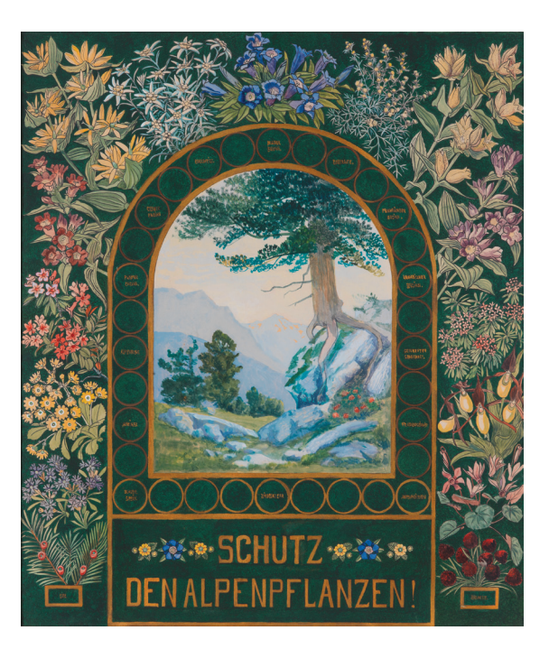
Figure 4 – Protect Alpine Flora. Poster by Gustav Jahn (1910).

Today tourism and NP cooperate in many respects. However, the NP brand has until recently only played a subordinate role in the highly developed, traditional destination of Berchtesgaden (Butzmann & Job 2016).