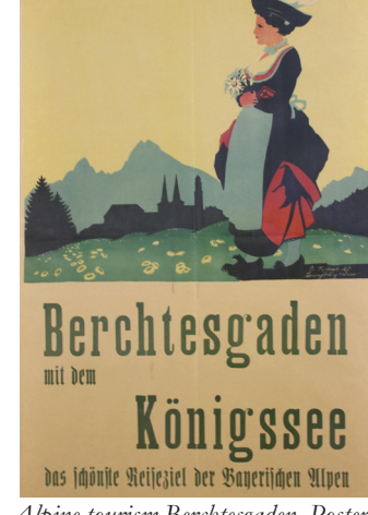
Figure 3 – Alpine tourism Berchtesgaden. Poster by Anton Reinbold (ca. 1910).

The area of Berchtesgaden had long been used for touristic purposes. For example, St. Bartholomew's