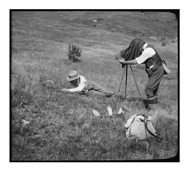
Figure 2 – Research as driving factor of the Swiss NP.

The motivation for establishing the NP derived from scholarly intentions to explore the development of nature once all human uses were abandoned. The initiative was taken by the explorer Paul Sarasin, president of Schweizerische Naturschutzkommission (Swiss Commission of Nature Conservation) established in 1906. Inspired by the early American NPs, the idea was to select an area which would be declared absolute free for animals and plants and in which any human interference would be prohibited ("welches für Tiere und Pflanzen zum absoluten Freigebiet erklärt würde, im welchem also jeder Eingriff in den Bestand des pflanzlichen und tierischen Lebens ausgeschlossen sein müßte" Schweizerische Naturschutzkommission 1909a). The search for an appropriate location for this experiment led to the valley of Cluozza, one of the economically least developed regions of the country. The communities were dependent on low-income farming and forestry and faced collapsing timber prices in the early 20th century. Hence they welcomed the idea of a NP based on attractive lease agreements: In 1909 a first contract with the community of Zernez was signed and further communities should follow. The Swiss parliament proclaimed the NP in 1914 and gave way to scientific works that until today have shaped the park's identity and its designated use as open air laboratory