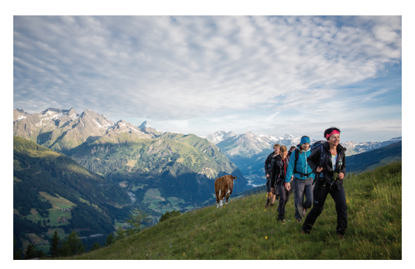
Figure 7 – Magic Moments. Cooperation between parks and tourism, example of Hohe Tauern National Park Carinthia.

The predominant narrative of this conception draws on the integrity and beauty of nature that gets disturbed and destroyed by any kind of human